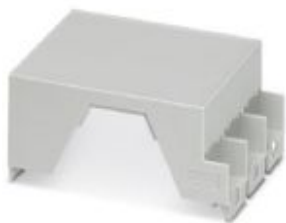
DIN rail housing, Upper housing part for connectors with header, width: 67.5 mm, height: 99 mm, depth: 45.85 mm, color: light gray (7035)

Please be informed that the data shown in this PDF Document is generated from our Online Catalog. Please find the complete data in the user's documentation. Our General Terms of Use for Downloads are valid ( http://phoenixcontact.com/download )