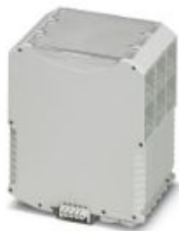
DIN rail housing, Complete housing with metal foot catch, tall design, without vents, width: 67.5 mm, height: 99 mm, depth: 114.5 mm, color: light gray (7035)

Please be informed that the data shown in this PDF Document is generated from our Online Catalog. Please find the complete data in the user's documentation. Our General Terms of Use for Downloads are valid ( http://phoenixcontact.com/download )