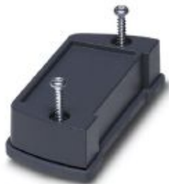
Profile housing, Side part, length: 15 mm, width: 77.4 mm

Please be informed that the data shown in this PDF Document is generated from our Online Catalog. Please find the complete data in the user's documentation. Our General Terms of Use for Downloads are valid ( http://phoenixcontact.com/download )