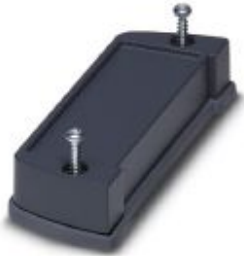
Profile housing, Side part, length: 15 mm, width: 101.9 mm

Please be informed that the data shown in this PDF Document is generated from our Online Catalog. Please find the complete data in the user's documentation. Our General Terms of Use for Downloads are valid ( http://phoenixcontact.com/download )