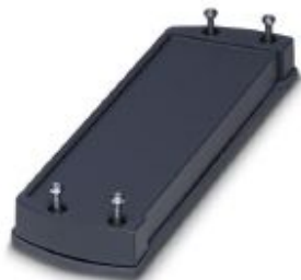
Profile housing, Side part, width: 190.4 mm

Please be informed that the data shown in this PDF Document is generated from our Online Catalog. Please find the complete data in the user's documentation. Our General Terms of Use for Downloads are valid ( http://phoenixcontact.com/download )