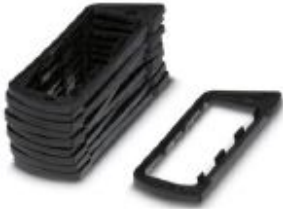
EMC seal for HC-ALU panel mounting base

Please be informed that the data shown in this PDF Document is generated from our Online Catalog. Please find the complete data in the user's documentation. Our General Terms of Use for Downloads are valid ( http://phoenixcontact.com/download )