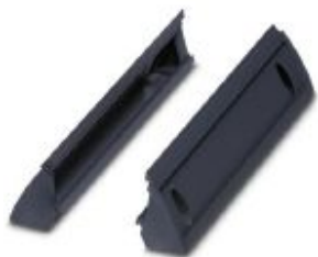
Mounting foot for panel mounting the HC-ALU panel mounting base

Please be informed that the data shown in this PDF Document is generated from our Online Catalog. Please find the complete data in the user's documentation. Our General Terms of Use for Downloads are valid ( http://phoenixcontact.com/download )