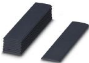
Decorative strip for HC-ALU panel mounting base

Please be informed that the data shown in this PDF Document is generated from our Online Catalog. Please find the complete data in the user's documentation. Our General Terms of Use for Downloads are valid ( http://phoenixcontact.com/download )