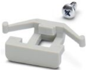
Press-drawn section housings, Snap-on foot for DIN rail, incl. screw

Please be informed that the data shown in this PDF Document is generated from our Online Catalog. Please find the complete data in the user's documentation. Our General Terms of Use for Downloads are valid ( http://phoenixcontact.com/download )