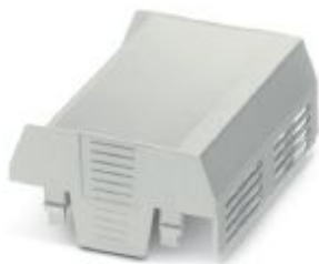
DIN rail housing, Upper part, flat design, One-way connection opening, with vents, width: 90.1 mm, height: 74.65 mm, depth: 36.95 mm, color: light gray (7035)

Please be informed that the data shown in this PDF Document is generated from our Online Catalog. Please find the complete data in the user's documentation. Our General Terms of Use for Downloads are valid ( http://phoenixcontact.com/download )