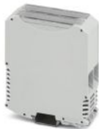
DIN rail housing, Complete housing with metal foot catch, tall design, with vents, width: 35 mm, height: 99 mm, depth: 114.5 mm, color: light gray (7035)

Please be informed that the data shown in this PDF Document is generated from our Online Catalog. Please find the complete data in the user's documentation. Our General Terms of Use for Downloads are valid ( http://phoenixcontact.com/download )