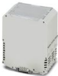
DIN rail housing, Complete housing with metal foot catch, tall design, with vents, width: 67.5 mm, height: 99 mm, depth: 114.5 mm, color: light gray (7035)

Please be informed that the data shown in this PDF Document is generated from our Online Catalog. Please find the complete data in the user's documentation. Our General Terms of Use for Downloads are valid ( http://phoenixcontact.com/download )