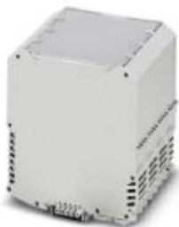
DIN rail housing, Complete housing with metal foot catch, tall design, with vents, width: 90 mm, height: 99 mm, depth: 114.5 mm, color: light gray (7035)

Please be informed that the data shown in this PDF Document is generated from our Online Catalog. Please find the complete data in the user's documentation. Our General Terms of Use for Downloads are valid ( http://phoenixcontact.com/download )