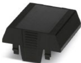
DIN rail housing, Upper part, tall design, without connection opening, width: 67.5 mm, height: 75.26 mm, depth: 36.95 mm, color: black (9005)

Please be informed that the data shown in this PDF Document is generated from our Online Catalog. Please find the complete data in the user's documentation. Our General Terms of Use for Downloads are valid ( http://phoenixcontact.com/download )