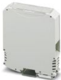
DIN rail housing, Complete housing with metal foot catch, tall design, with vents, width: 22.5 mm, height: 99 mm, depth: 114.5 mm, color: light gray (7035)

Please be informed that the data shown in this PDF Document is generated from our Online Catalog. Please find the complete data in the user's documentation. Our General Terms of Use for Downloads are valid ( http://phoenixcontact.com/download )