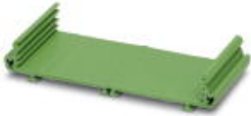
The figure shows the variant UM 45-Profil CM

Drawn section panel mounting base, with a constructional width of 108 mm and a fixed length of 200 cm