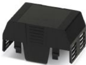
DIN rail housing, Upper part, flat design, Without connection opening, with vents, width: 45.1 mm, height: 74.65 mm, depth: 36.95 mm, color: black (9005)

Please be informed that the data shown in this PDF Document is generated from our Online Catalog. Please find the complete data in the user's documentation. Our General Terms of Use for Downloads are valid ( http://phoenixcontact.com/download )