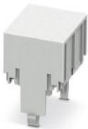
DIN rail housing, 2U, Housing cover, width: 18.9 mm, height: 21.8 mm, depth: 26 mm, color: light gray (7035)

Please be informed that the data shown in this PDF Document is generated from our Online Catalog. Please find the complete data in the user's documentation. Our General Terms of Use for Downloads are valid ( http://phoenixcontact.com/download )