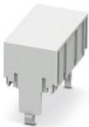
DIN rail housing, 3U, Housing cover, width: 18.9 mm, height: 32.8 mm, depth: 26 mm, color: light gray (7035)

Please be informed that the data shown in this PDF Document is generated from our Online Catalog. Please find the complete data in the user's documentation. Our General Terms of Use for Downloads are valid ( http://phoenixcontact.com/download )