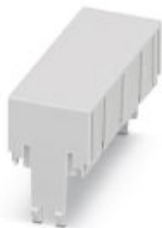
DIN rail housing, 4U, Housing cover, width: 18.9 mm, height: 43.8 mm, depth: 26 mm, color: light gray (7035)

Please be informed that the data shown in this PDF Document is generated from our Online Catalog. Please find the complete data in the user's documentation. Our General Terms of Use for Downloads are valid ( http://phoenixcontact.com/download )