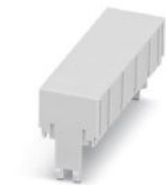
DIN rail housing, 5U, Housing cover, width: 18.9 mm, height: 54.8 mm, depth: 26 mm, color: light gray (7035)

Please be informed that the data shown in this PDF Document is generated from our Online Catalog. Please find the complete data in the user's documentation. Our General Terms of Use for Downloads are valid ( http://phoenixcontact.com/download )