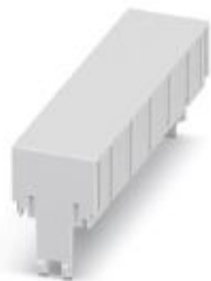
DIN rail housing, 6U, Housing cover, width: 18.9 mm, height: 65.8 mm, depth: 26 mm, color: light gray (7035)

Please be informed that the data shown in this PDF Document is generated from our Online Catalog. Please find the complete data in the user's documentation. Our General Terms of Use for Downloads are valid ( http://phoenixcontact.com/download )