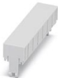
DIN rail housing, 7U, Housing cover, width: 18.9 mm, height: 76.8 mm, depth: 26 mm, color: light gray (7035)

Please be informed that the data shown in this PDF Document is generated from our Online Catalog. Please find the complete data in the user's documentation. Our General Terms of Use for Downloads are valid ( http://phoenixcontact.com/download )