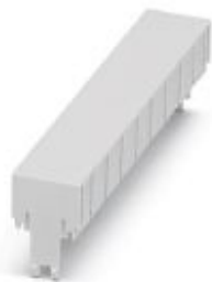
DIN rail housing, 9U, Housing cover, width: 18.9 mm, height: 98.8 mm, depth: 26 mm, color: light gray (7035)

Please be informed that the data shown in this PDF Document is generated from our Online Catalog. Please find the complete data in the user's documentation. Our General Terms of Use for Downloads are valid ( http://phoenixcontact.com/download )