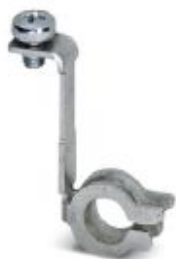
PE contact for UM-BASIC panel mounting base for connecting the PCB to the DIN rail at level 2

Please be informed that the data shown in this PDF Document is generated from our Online Catalog. Please find the complete data in the user's documentation. Our General Terms of Use for Downloads are valid ( http://phoenixcontact.com/download )