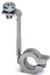
PE contact for UM-BASIC panel mounting base for connecting the PCB to the DIN rail at level 3

Please be informed that the data shown in this PDF Document is generated from our Online Catalog. Please find the complete data in the user's documentation. Our General Terms of Use for Downloads are valid ( http://phoenixcontact.com/download )