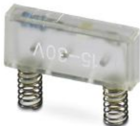
Light indicator, color: transparent

Please be informed that the data shown in this PDF Document is generated from our Online Catalog. Please find the complete data in the user's documentation. Our General Terms of Use for Downloads are valid ( http://phoenixcontact.com/download )