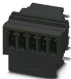
PCB headers, number of positions: 5, pitch: 3.5 mm, pin layout: Linear pinning, Article with lateral pin exit

Please be informed that the data shown in this PDF Document is generated from our Online Catalog. Please find the complete data in the user's documentation. Our General Terms of Use for Downloads are valid ( http://phoenixcontact.com/download )