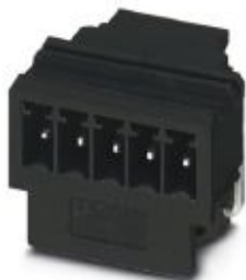
PCB headers, number of positions: 5, pitch: 3.5 mm, pin layout: Linear pinning, Article with lateral pin exit

Please be informed that the data shown in this PDF Document is generated from our Online Catalog. Please find the complete data in the user's documentation. Our General Terms of Use for Downloads are valid ( http://phoenixcontact.com/download )