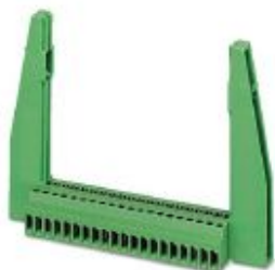
19" plug-in card block, number of positions: 20, pitch: 5 mm, contact surface: Tin

Please be informed that the data shown in this PDF Document is generated from our Online Catalog. Please find the complete data in the user's documentation. Our General Terms of Use for Downloads are valid ( http://phoenixcontact.com/download )