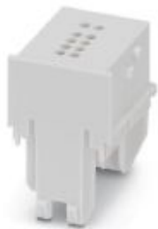
DIN rail housing, 2U for marking lid, Housing cover, width: 18.9 mm, height: 21.9 mm, depth: 26 mm, color: light gray (7035)

Please be informed that the data shown in this PDF Document is generated from our Online Catalog. Please find the complete data in the user's documentation. Our General Terms of Use for Downloads are valid ( http://phoenixcontact.com/download )