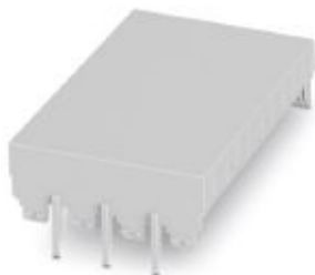
DIN rail housing, 10U, Housing cover, width: 75.87 mm, height: 109.8 mm, depth: 26 mm, color: light gray (7035)

Please be informed that the data shown in this PDF Document is generated from our Online Catalog. Please find the complete data in the user's documentation. Our General Terms of Use for Downloads are valid ( http://phoenixcontact.com/download )