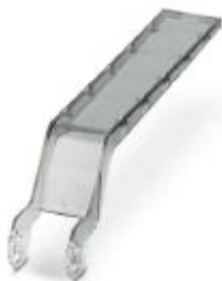
DIN rail housing, 8U, Marking lid, width: 18.8 mm, height: 110.95 mm, color: transparent

Please be informed that the data shown in this PDF Document is generated from our Online Catalog. Please find the complete data in the user's documentation. Our General Terms of Use for Downloads are valid ( http://phoenixcontact.com/download )