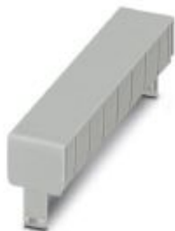
DIN rail housing, 8U, Housing cover, width: 18.9 mm, height: 87.8 mm, depth: 26 mm, color: light gray (7035)

Please be informed that the data shown in this PDF Document is generated from our Online Catalog. Please find the complete data in the user's documentation. Our General Terms of Use for Downloads are valid ( http://phoenixcontact.com/download )