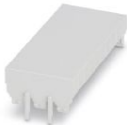
DIN rail housing, 10U, Housing cover, width: 56.88 mm, height: 109.8 mm, depth: 26 mm, color: light gray (7035)

Please be informed that the data shown in this PDF Document is generated from our Online Catalog. Please find the complete data in the user's documentation. Our General Terms of Use for Downloads are valid ( http://phoenixcontact.com/download )