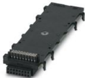
DIN rail connector, number of positions: 16, pitch: 2.54 mm, color: jet black

Please be informed that the data shown in this PDF Document is generated from our Online Catalog. Please find the complete data in the user's documentation. Our General Terms of Use for Downloads are valid ( http://phoenixcontact.com/download )