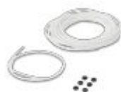
Sealing set without battery chamber, including cord and O-rings