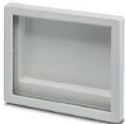
Display housing, 15", light gray, central window, front level, consisting of two half shells with screws

Please be informed that the data shown in this PDF Document is generated from our Online Catalog. Please find the complete data in the user's documentation. Our General Terms of Use for Downloads are valid ( http://phoenixcontact.com/download )