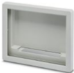
Display housing, 15", light gray, central window, front level, with cutout for connection technology angle plate consisting of two half shells with screws

Please be informed that the data shown in this PDF Document is generated from our Online Catalog. Please find the complete data in the user's documentation. Our General Terms of Use for Downloads are valid ( http://phoenixcontact.com/download )