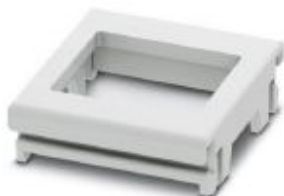
DIN rail housing, ICS filler, with RJ45 function cutout, width: 25 mm, height: 7 mm, depth: 22.5 mm, color: light gray (7035)

Please be informed that the data shown in this PDF Document is generated from our Online Catalog. Please find the complete data in the user's documentation. Our General Terms of Use for Downloads are valid ( http://phoenixcontact.com/download )