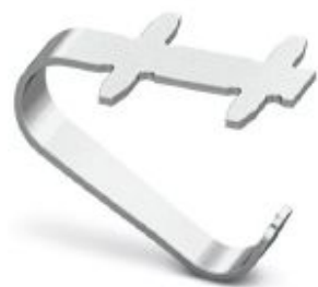
Functional ground contact, for ICS series electronics housings

Please be informed that the data shown in this PDF Document is generated from our Online Catalog. Please find the complete data in the user's documentation. Our General Terms of Use for Downloads are valid ( http://phoenixcontact.com/download )