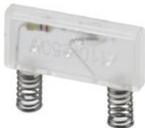
Light indicator, color: transparent

Please be informed that the data shown in this PDF Document is generated from our Online Catalog. Please find the complete data in the user's documentation. Our General Terms of Use for Downloads are valid ( http://phoenixcontact.com/download )