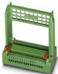
19" plug-in card block, number of positions: 32, pitch: 5.08 mm, color: green

Please be informed that the data shown in this PDF Document is generated from our Online Catalog. Please find the complete data in the user's documentation. Our General Terms of Use for Downloads are valid ( http://phoenixcontact.com/download )