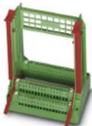
19" plug-in card block, number of positions: 64, pitch: 2.54 mm, color: green

Please be informed that the data shown in this PDF Document is generated from our Online Catalog. Please find the complete data in the user's documentation. Our General Terms of Use for Downloads are valid ( http://phoenixcontact.com/download )