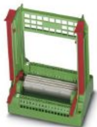
19" plug-in card block, number of positions: 48, pitch: 5.08 mm, color: green

Please be informed that the data shown in this PDF Document is generated from our Online Catalog. Please find the complete data in the user's documentation. Our General Terms of Use for Downloads are valid ( http://phoenixcontact.com/download )