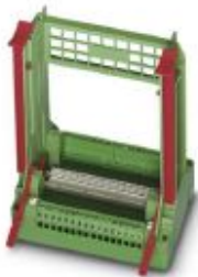
19" plug-in card block, number of positions: 32, pitch: 5.08 mm, color: green

Please be informed that the data shown in this PDF Document is generated from our Online Catalog. Please find the complete data in the user's documentation. Our General Terms of Use for Downloads are valid ( http://phoenixcontact.com/download )