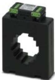
Window-type current transformer, 200 A AC primary current; 5 A AC secondary current; accuracy class 1; 5 VA rated power

Please be informed that the data shown in this PDF Document is generated from our Online Catalog. Please find the complete data in the user's documentation. Our General Terms of Use for Downloads are valid ( http://phoenixcontact.com/download )