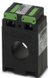
Bus-bar current transformer, 400 A AC primary current; 5 A AC secondary current; accuracy class 1; 5 VA rated power

Please be informed that the data shown in this PDF Document is generated from our Online Catalog. Please find the complete data in the user's documentation. Our General Terms of Use for Downloads are valid ( http://phoenixcontact.com/download )