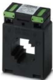
Window-type current transformer, 150 A AC primary current; 5 A AC secondary current; accuracy class 1; 5 VA rated power

Please be informed that the data shown in this PDF Document is generated from our Online Catalog. Please find the complete data in the user's documentation. Our General Terms of Use for Downloads are valid ( http://phoenixcontact.com/download )