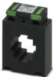
Window-type current transformer, 250 A AC primary current; 5 A AC secondary current; accuracy class 1; 5 VA rated power

Please be informed that the data shown in this PDF Document is generated from our Online Catalog. Please find the complete data in the user's documentation. Our General Terms of Use for Downloads are valid ( http://phoenixcontact.com/download )